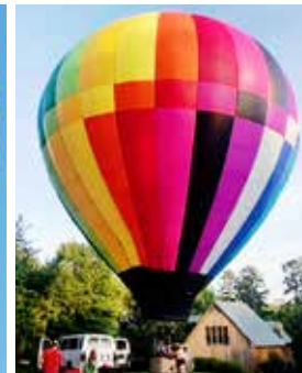
Violet Pilot: Mike Klawitter Sponsor: The UPS Store