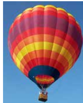
Sedona Sunset Pilot: Glenn O'Connell Sponsor: Lift Me Up Balloon/John & Evy Nerbonne

3pm: BALLOON LAUNCH at E.P. Rock school grounds, 340 13th Street South. This is an optional flight if morning flight launched or a mass ascension if morning flight was canceled. Event highlight! All inflations and flights are weather dependent.