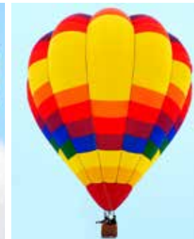
Wildfire Pilot: Sonja Belgarde Sponsor: WESTconsin Credit Union