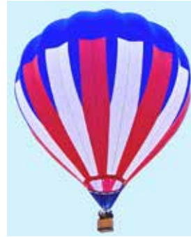
Enchanted Pilot: Brett Tupy Sponsor: Hudson Hot Air Affair