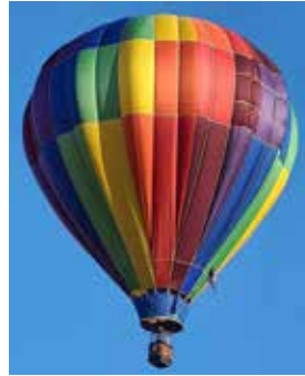
Clyde-O-Scope Pilot: Bill Wiess Sponsor: Hudson Hot Air Affair