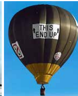
PH-TEU Pilot: Pete Asp Sponsor: Hudson Vintage Neighborhood Alliance