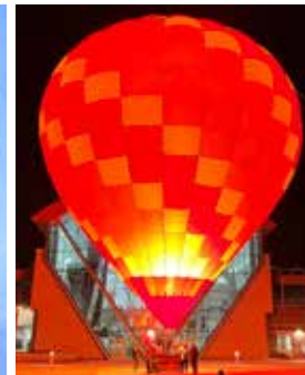
PALS Pilot: Sean Eakin Sponsor: Cardinal Glass