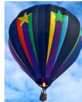
Starburst of Destiny Pilot: Bethany Reuter Sponsor: Twin City Orthopedics-Hudson