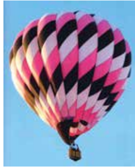
Air Forge Pilot: Mike Reinert Sponsor: Richard Pierce Memorial Flight

Hot Air Affair Balloon Launches are scheduled for: Saturday and Sunday, February 4 and 5 at 7:35 am. Over 30 hot air balloons in mass ascension flight at E.P. Rock school grounds, 340 13th Street South, Hudson, WI. An optional launch is scheduled for Saturday, February 4 at 3pm if morning launch is canceled. All balloon inflations and flights are weather dependent. Launch updates will be posted at HudsonHotAirAffair.com and on Facebook before each launch.